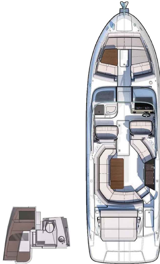
AREA UNDER PORT CONSOLE Shown with optional Port Hideaway® berth upgrade amenities