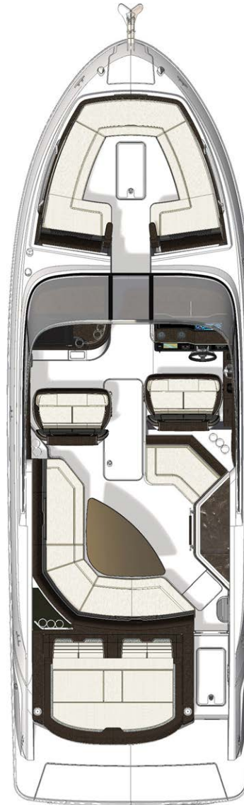
STANDARD SEATING PLAN