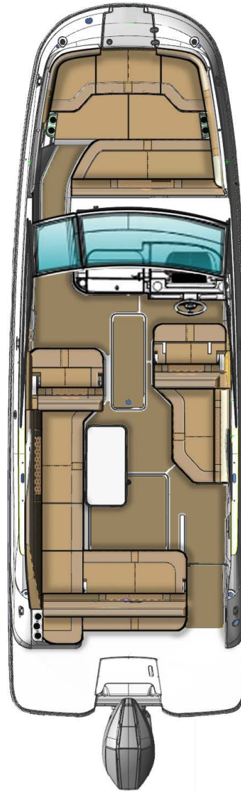
STANDARD SEATING PLAN