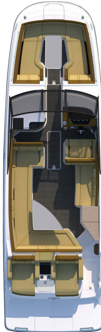
STANDARD SEATING PLAN