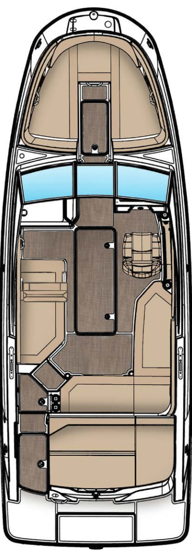
OPTIONAL PORT BENCH SEAT